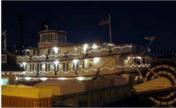
Spirit of Peoria decorated for the holidays