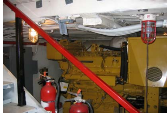
Engine Room – One of the Cat 3412 350kw